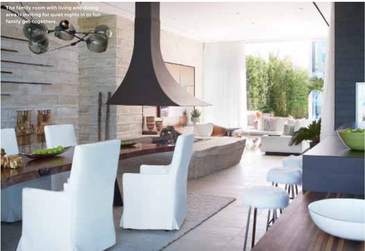
The family room with living and dining area is inviting for quiet nights in or fun family get-togethers.

provide the contractor with floor outlet and plumbing positions as he was about to pour the ground-floor slab. In parallel, Katherine and the designer worked on the “big picture”, defining the desired style for the interiors as well as material and colour palettes to start the selection of hard finishes and the design of stairs, bathrooms and kitchens.