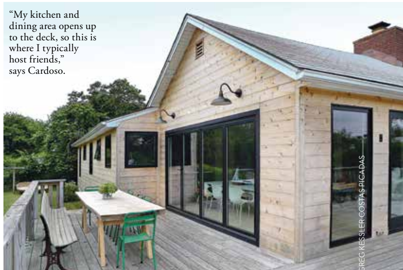
"My kitchen and dining area opens up to the deck, so this is where I typically host friends," says Cardoso.