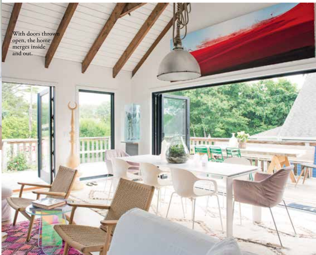
With doors thrown open, the home merges inside and out.