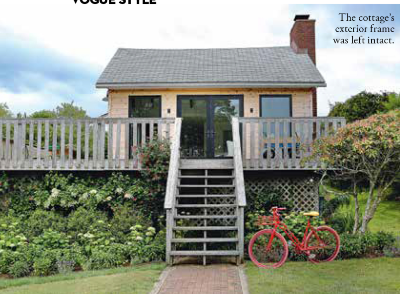
The cottage's exterior frame was left intact.