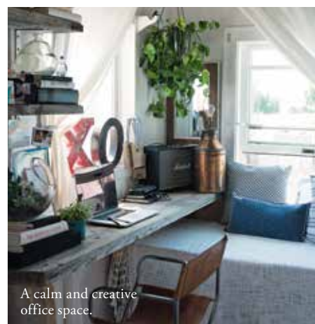
A calm and creative office space.