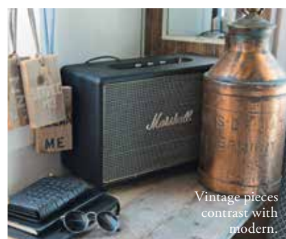
Vintage pieces contrast with modern.