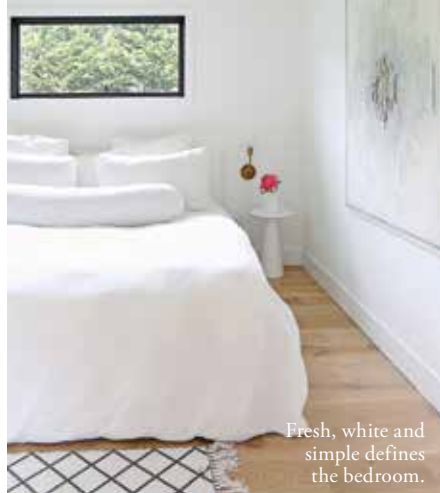
Fresh, white and simple defines the bedroom.